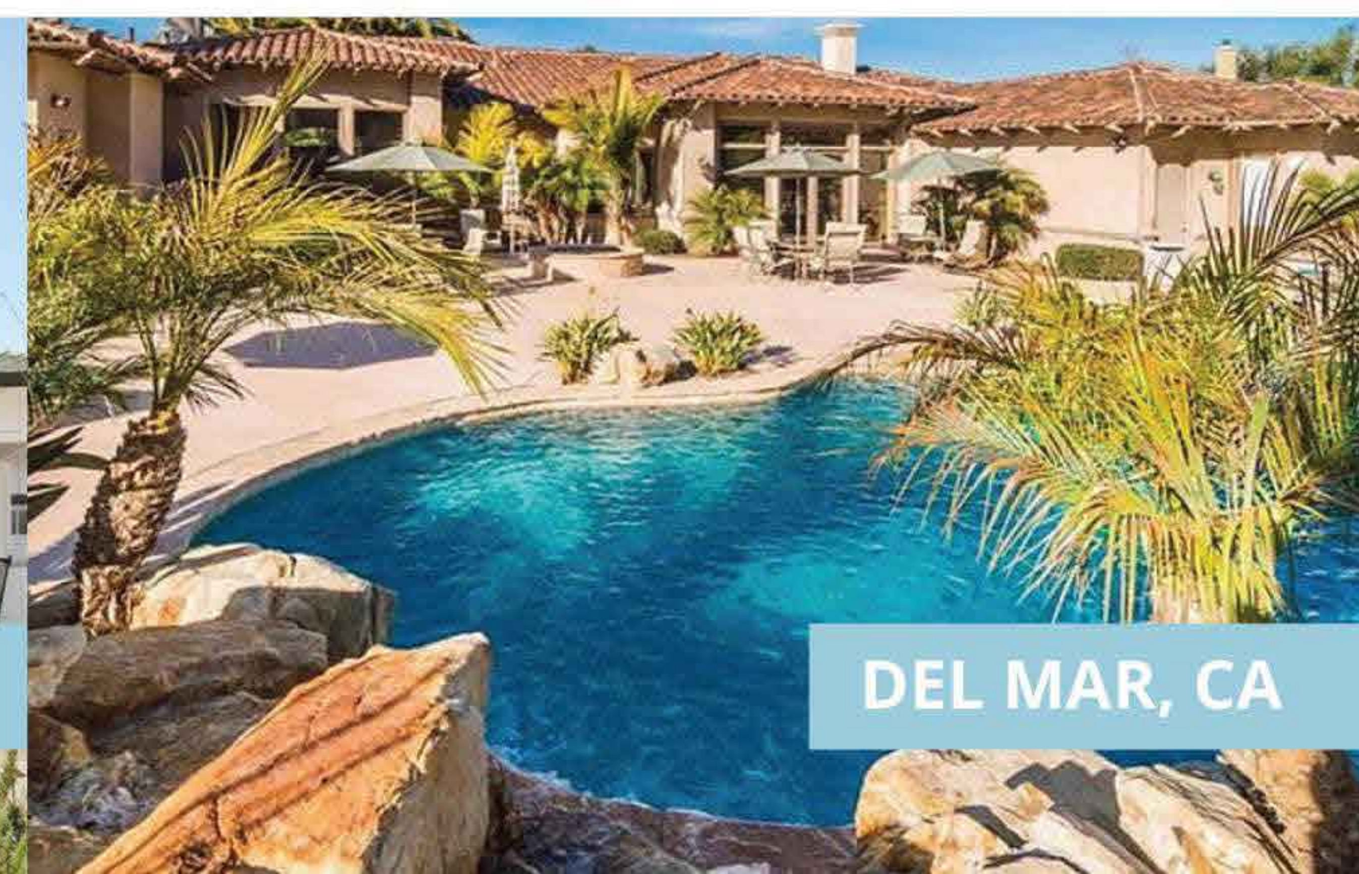
DEL MAR, CA